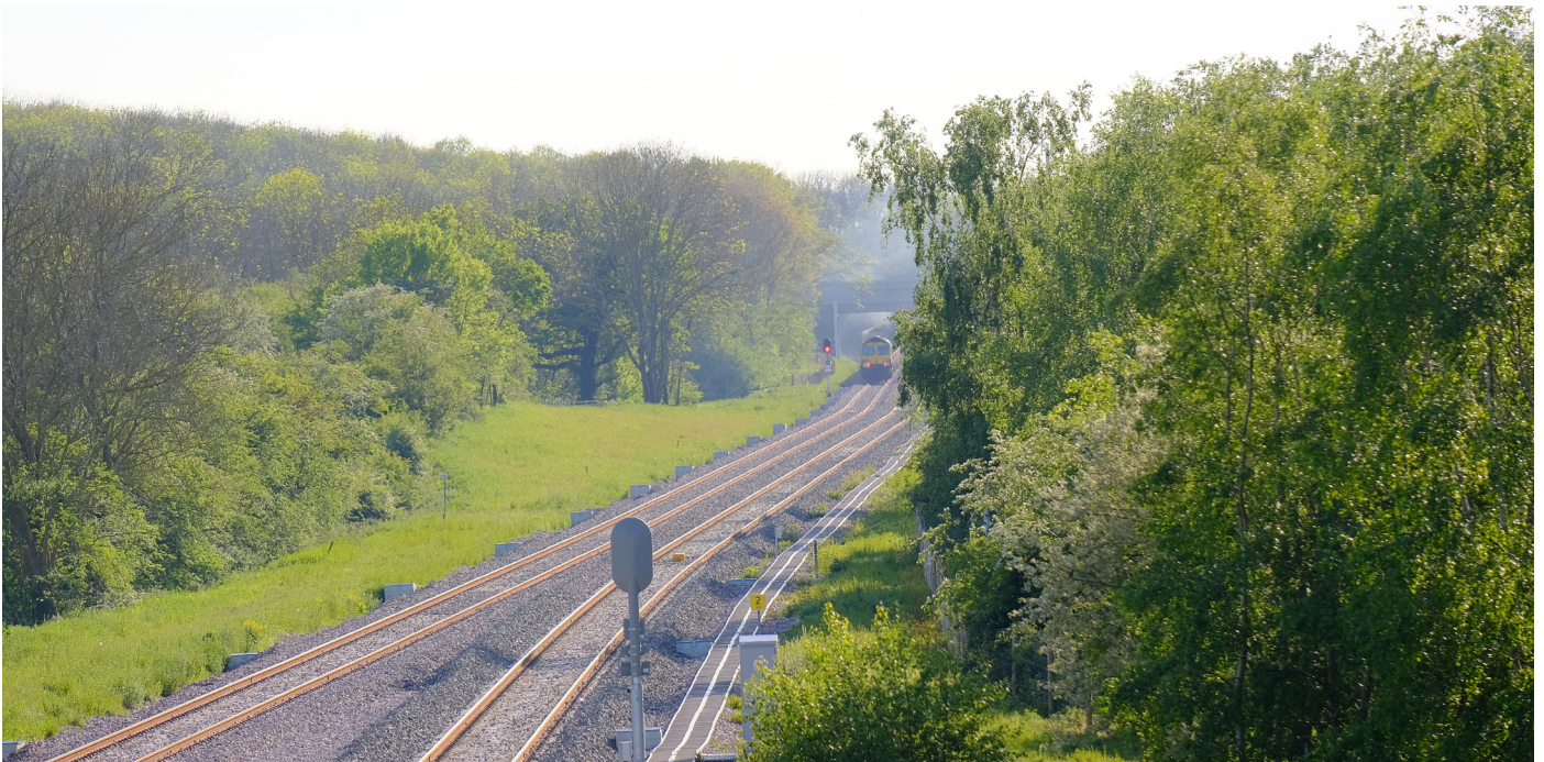
A view of the completed railway from OXD9 Whaddon Road, Newton Longville looking west, May 2024