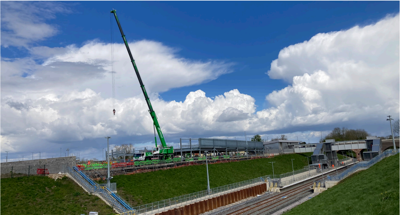
Winslow Station car park construction for Buckinghamshire Council in progress with a crane being used to lift the steel beams and place concrete panels