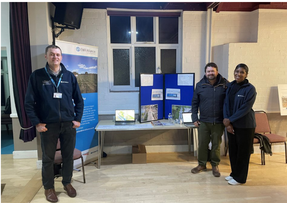
Members of EWR Alliance at a drop in session in Twyford

Thank you to all who have attended our drop-in events over the years, if you do have any questions please contact us at publicinformation@ewralliance.co.uk