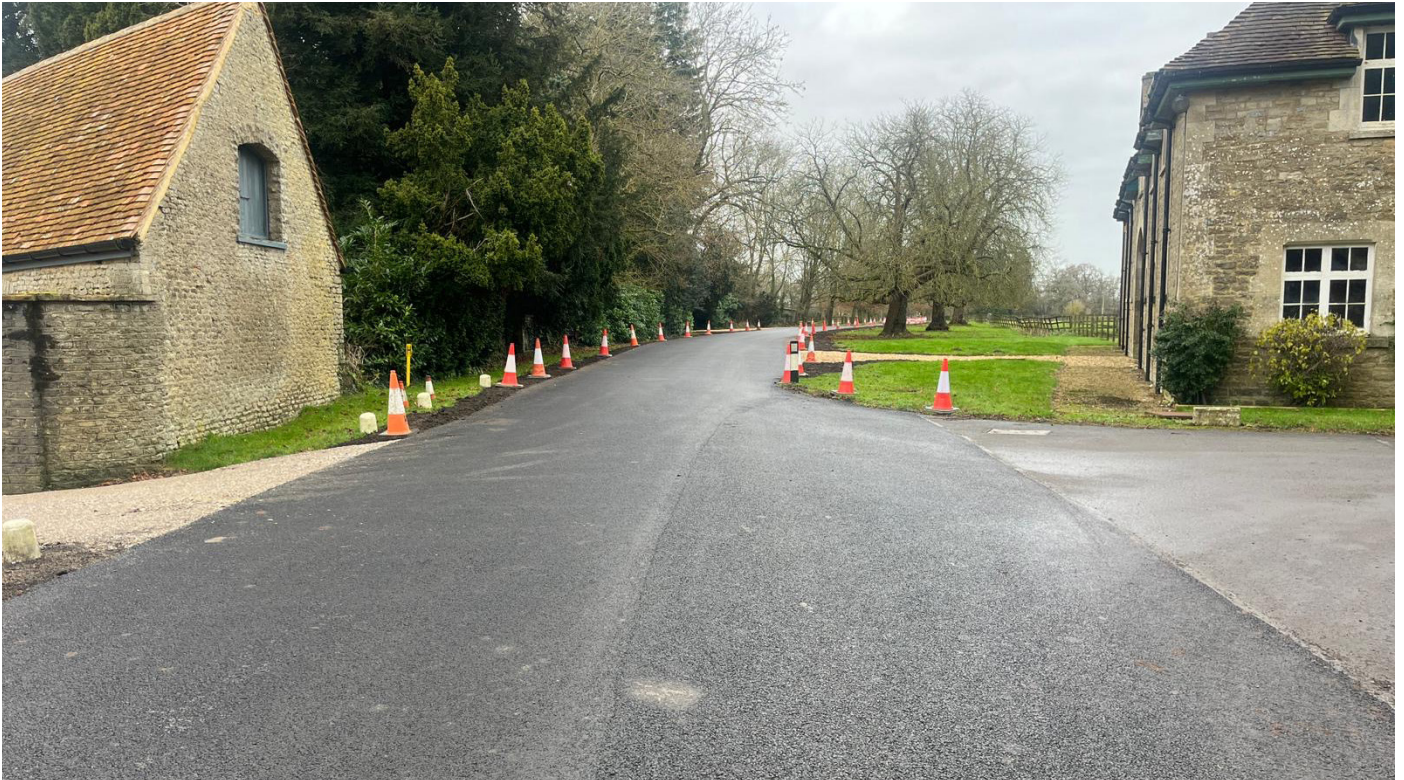
Resurfaced road in Stratton Audley