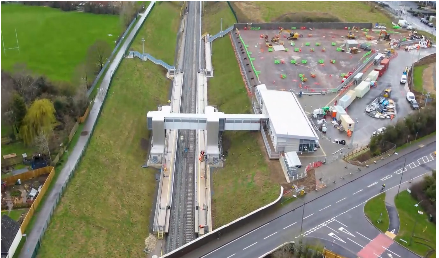
Aerial image of Winslow Station and progress on the station car park, March 2024