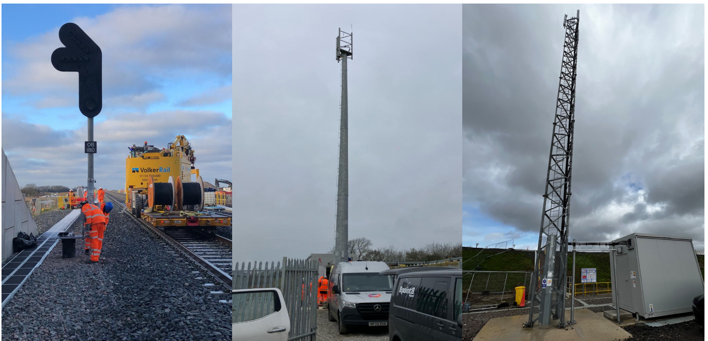
L-R: A signal installed on site, a tower and a lattice tower Global System for Mobile Communications-Railway mast.

In addition to the installation of the assets associated with the power distribution (Distribution Network Operator Cubicles, Principal Supply Points and Auxiliary Supply Points), the team has also completed the installation of systems such as the Global System for Mobile Communications- Railway (GSMR) and is now in the system testing phase of the works.