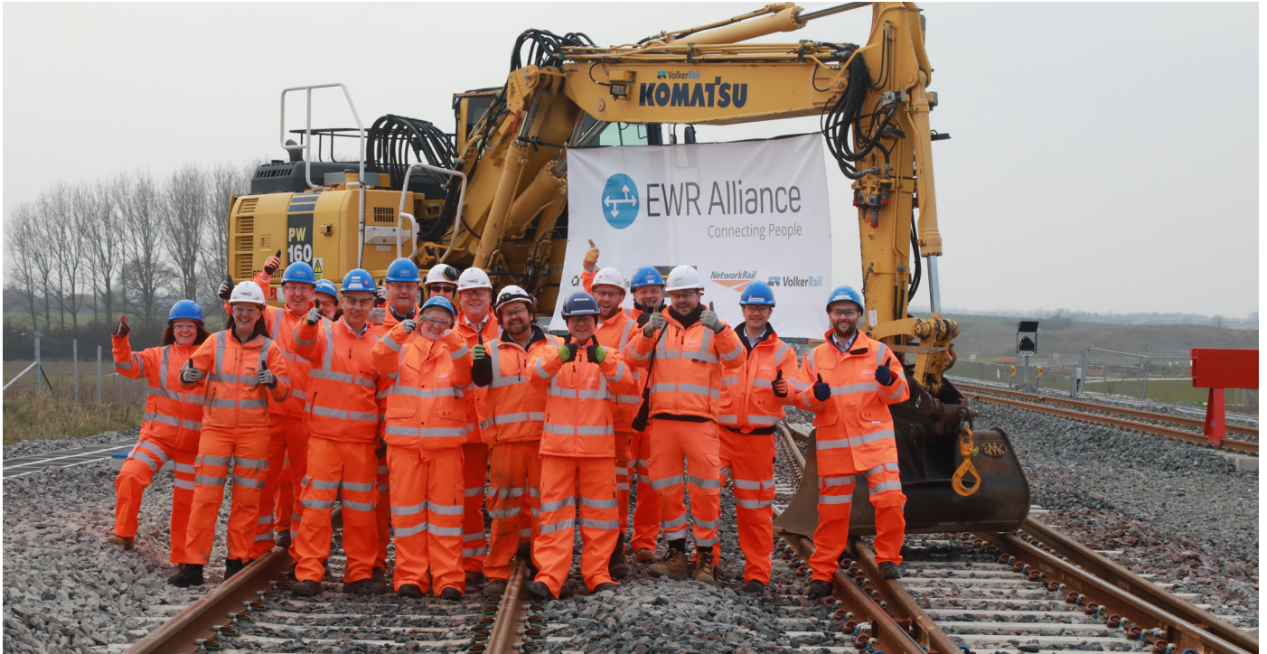
The East West Rail Alliance team marking the completion of track construction from Bicester to Bletchley, March 2024