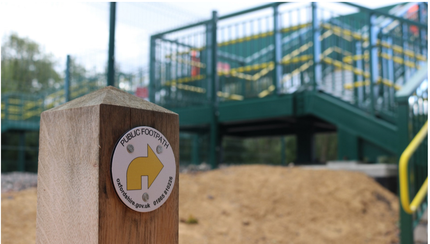
Jarvis Lane footbridge in Bicester